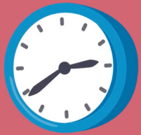
Workers' Hub Film