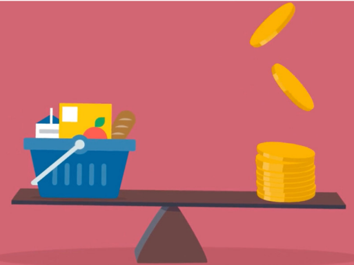
Parents' Hub Film