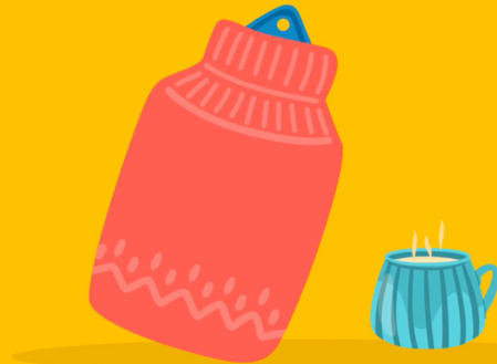
Carers' Hub Film