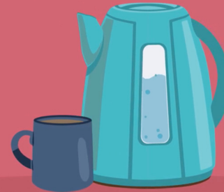
Pensioners' Hub Film